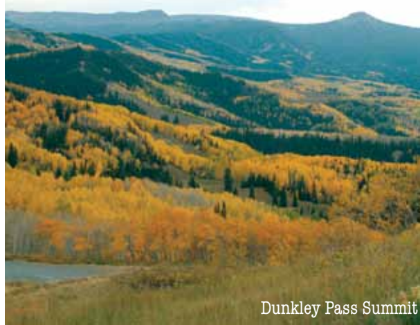
Dunkley Pass Summit