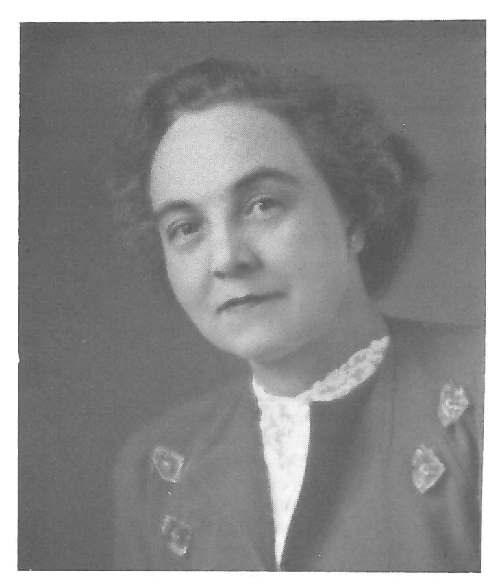
"I had never forgotten Colorado."

here I am just going strong. California was just a different place. I know when I first started high school in, California, it was a new high school, one of the finest schools in California. My mother went with me to register. I was in the office and the woman was taking my name and so forth and about that time school was dismissed, and you could hear the people out in the halls. It was just a terrible noise. I was just a little country girl and I burst into tears. Didn't take me long to live that down and I got used to it and liked it, but it was a change, a big change. I was only 13 years old.