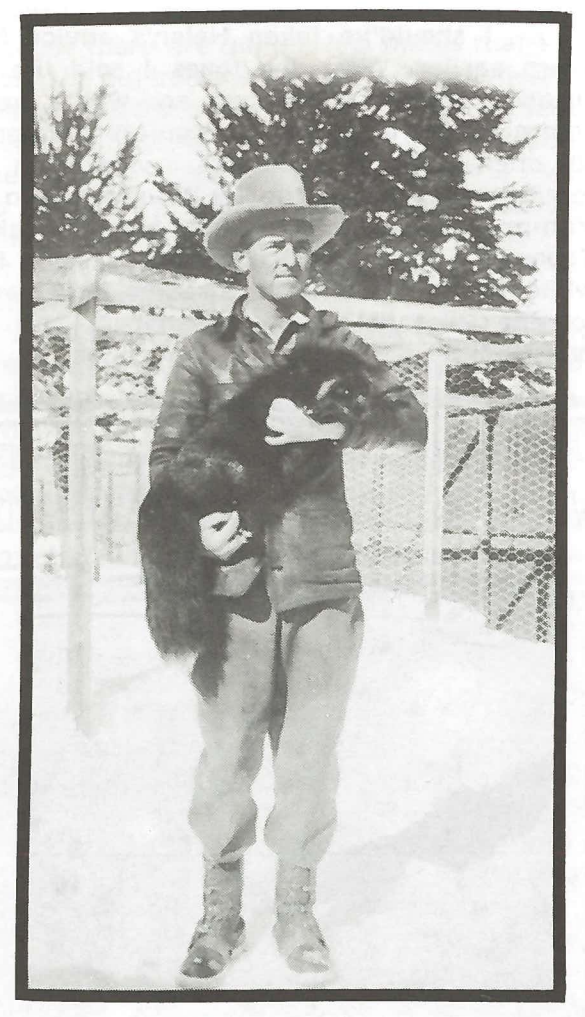
A PRIZED POSSESSION!