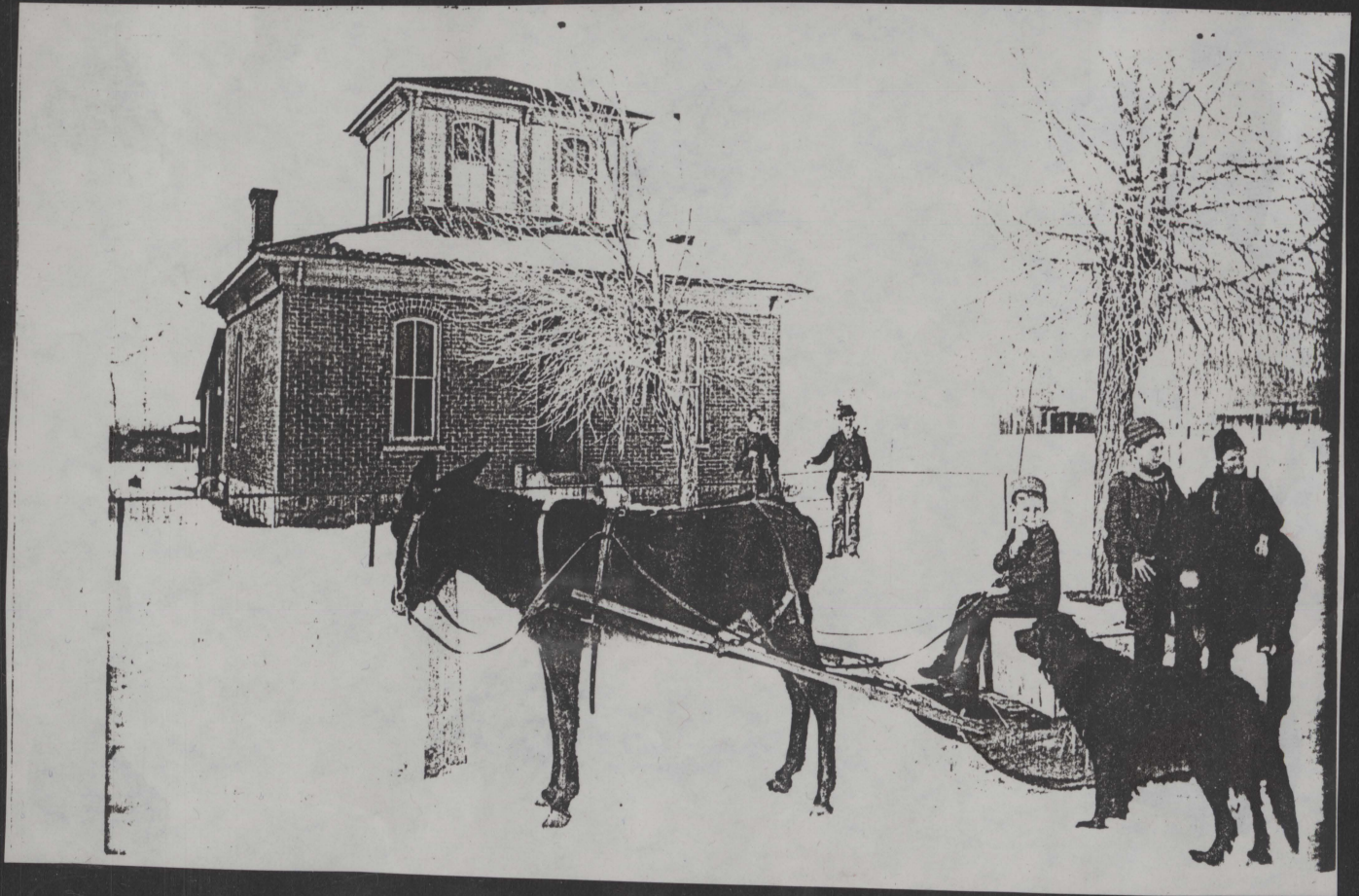
Common Transportation The Burro