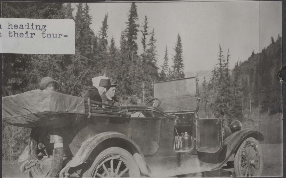
1915- On Blue Mesa heading toward Gunnison in their touring car.