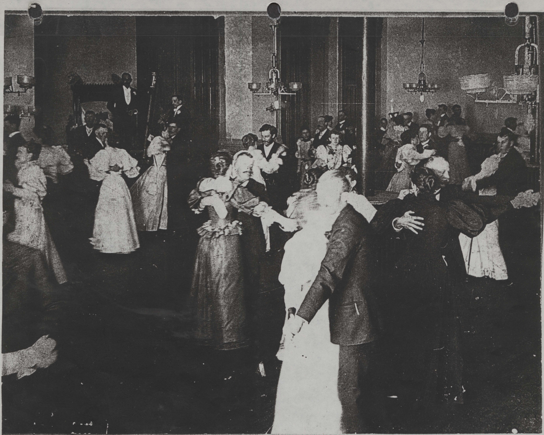
Dance at the La Veta Hotel