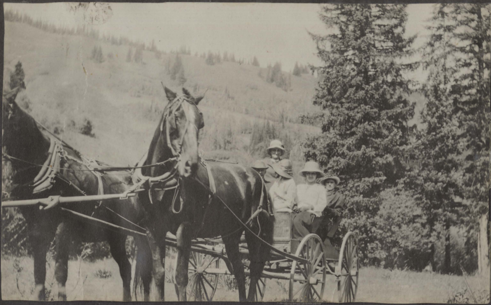
En-route to Aspen.