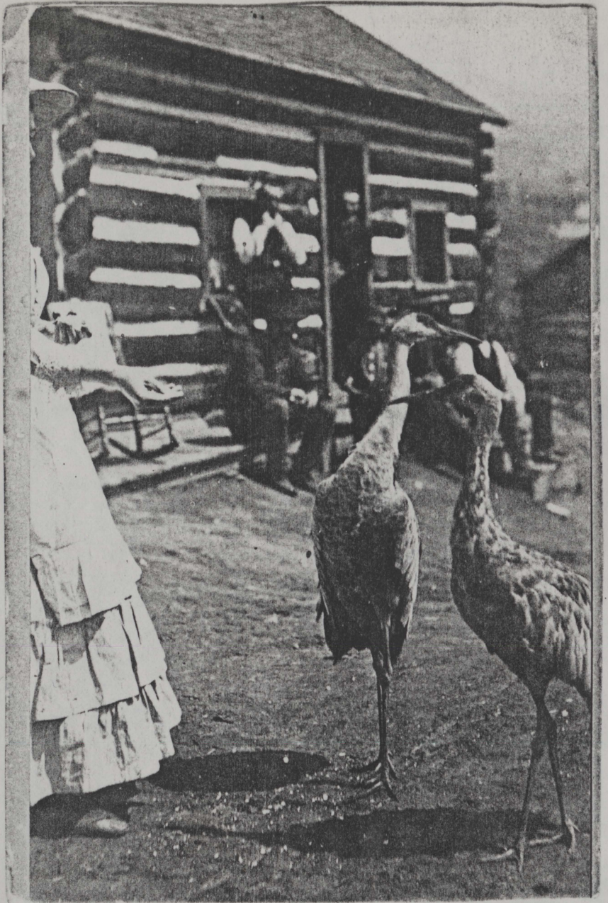
Greater Sandhill Cranes stop at Baldwin.