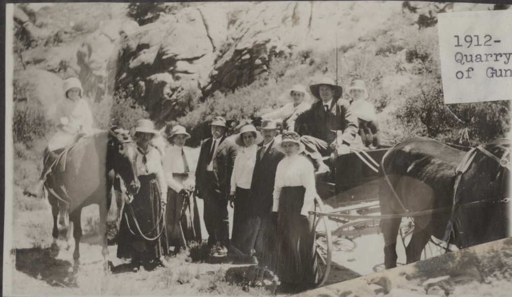
1912- A Trip to the Aberdeen Quarry, eight miles southwest of Gunnison