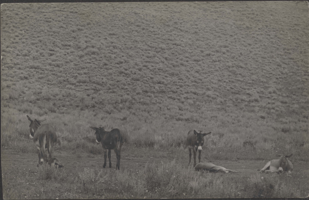
Wild burros on Antelope Flat across from town