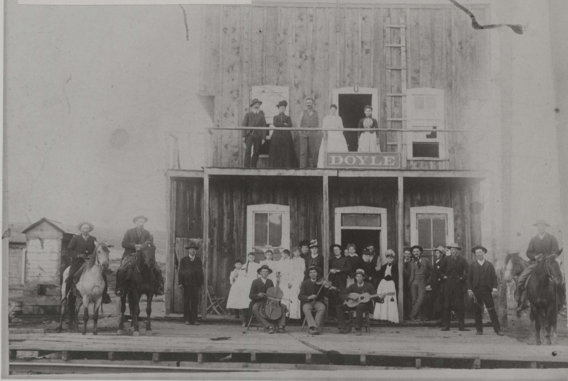
Two story dance hall Doyleville, Colorado