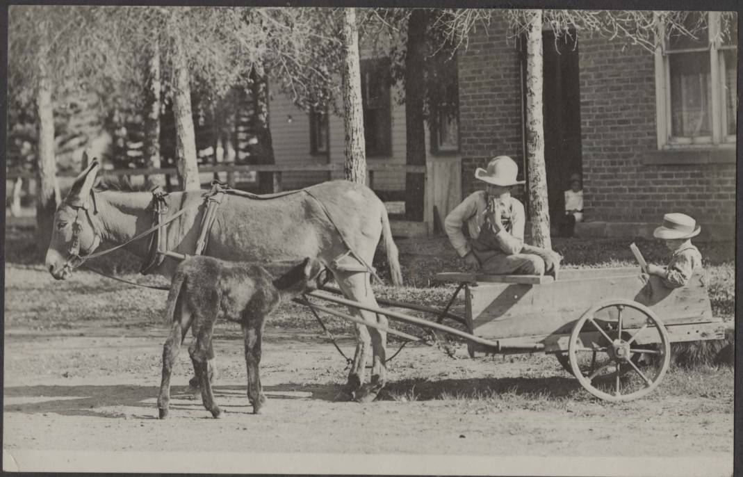
Stop for Lunch