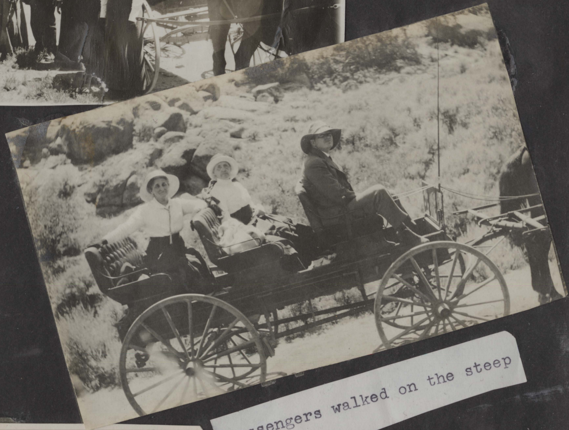
Passengers walked on the steep grades.