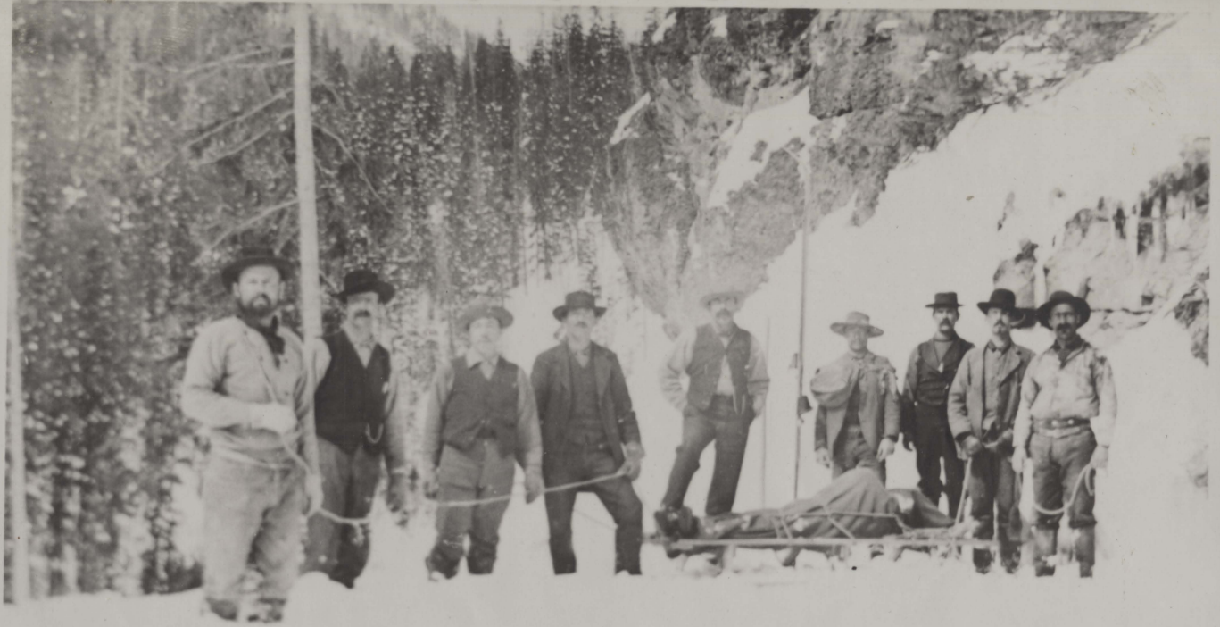
Bringing out a victim of a snow slide