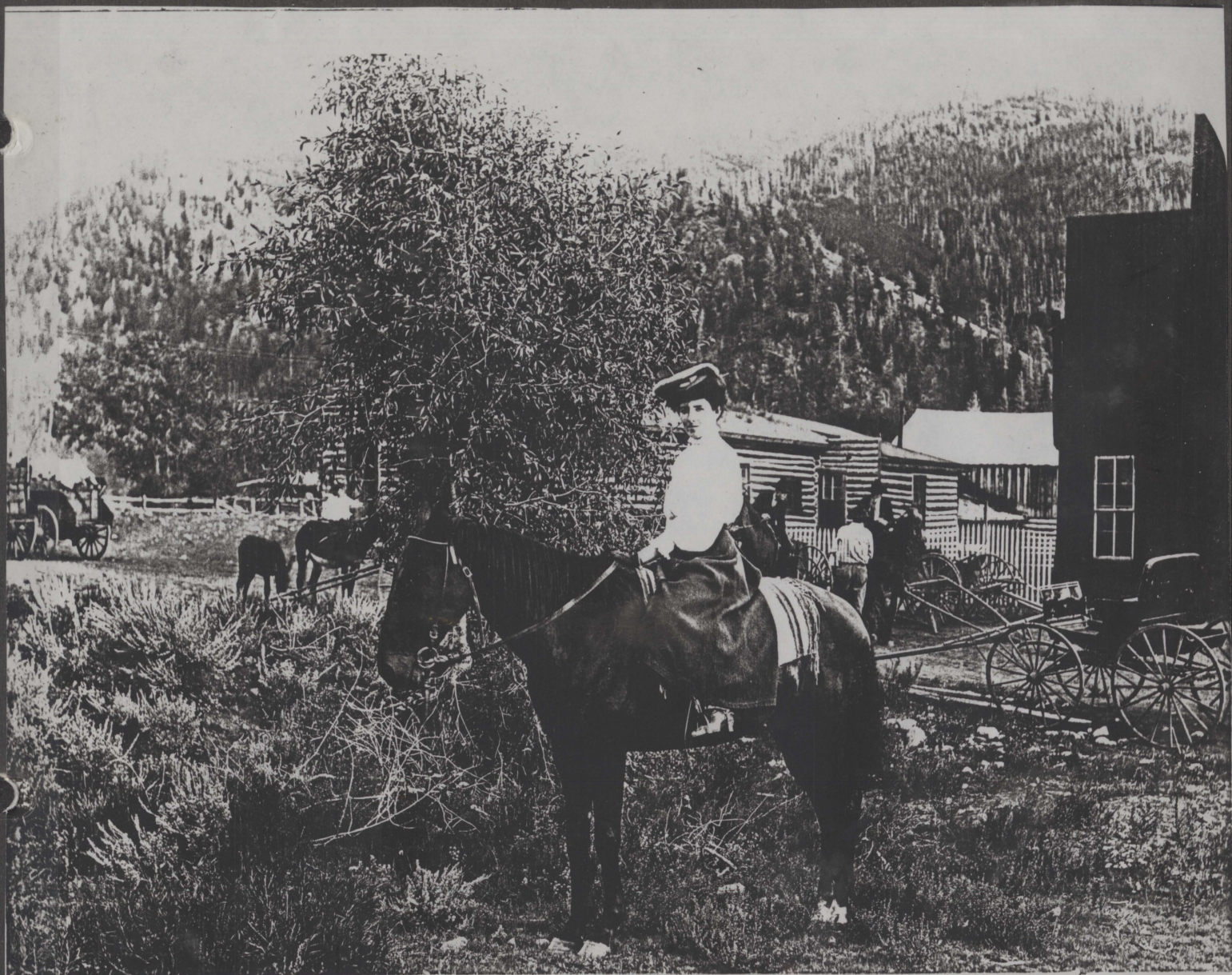
- Ohio City -

Two Gentlemen and a Lady take to the Saddle