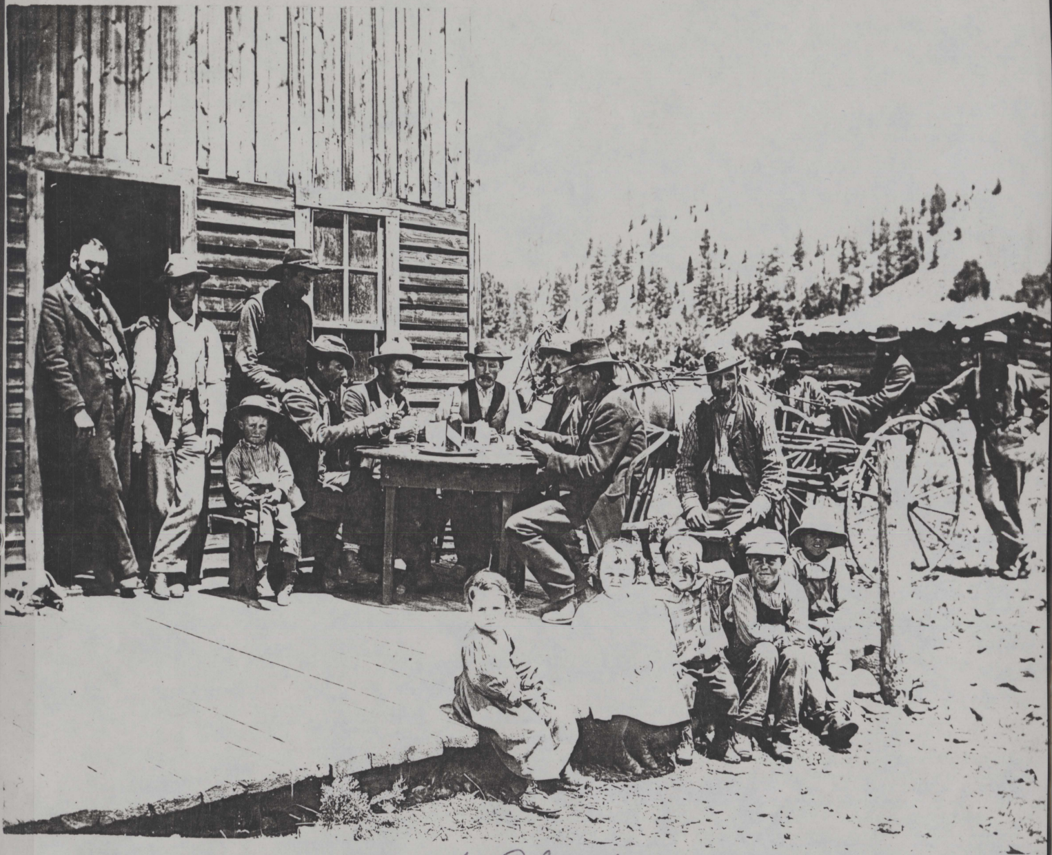
Miners day off at Ohio City - Mom sent the kids along.