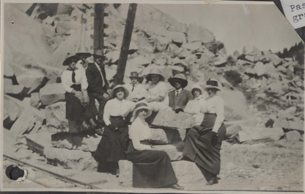
At Aberdeen Quarry