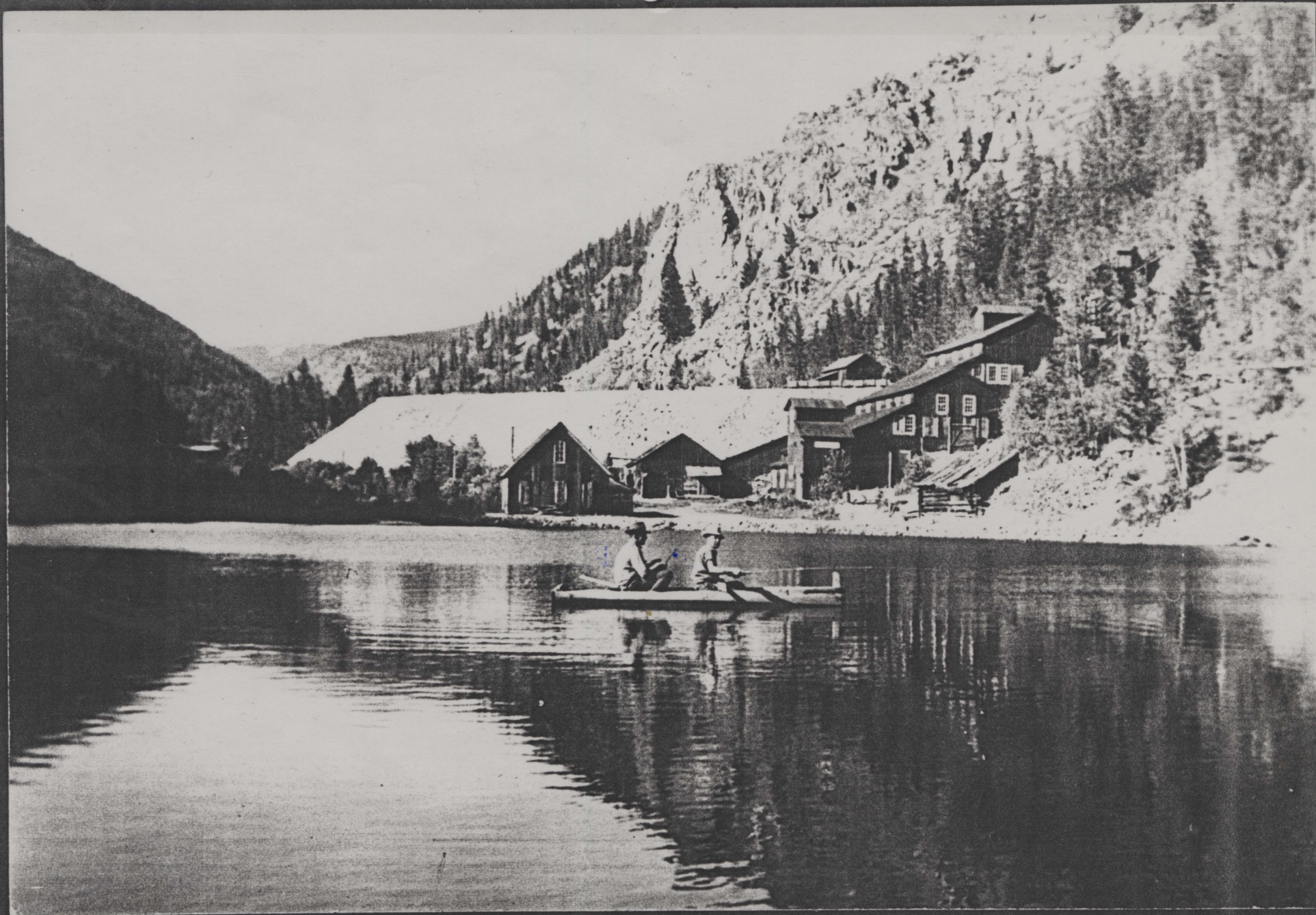
Carter Lake on Gold Creek Raymond Mine in Background