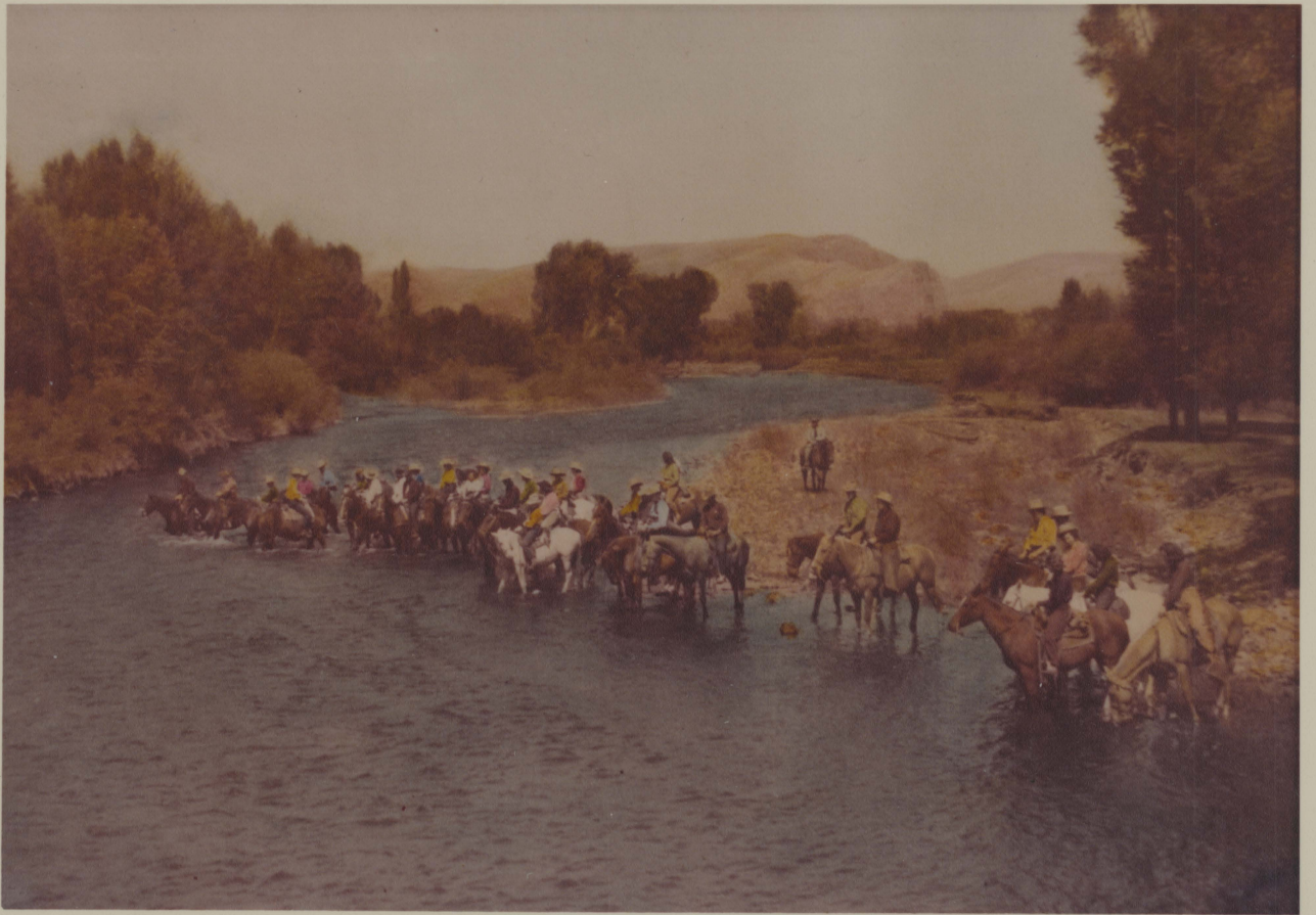
"Range Riders" a Club