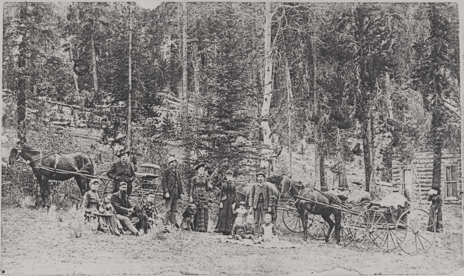
Deering Family Picnic