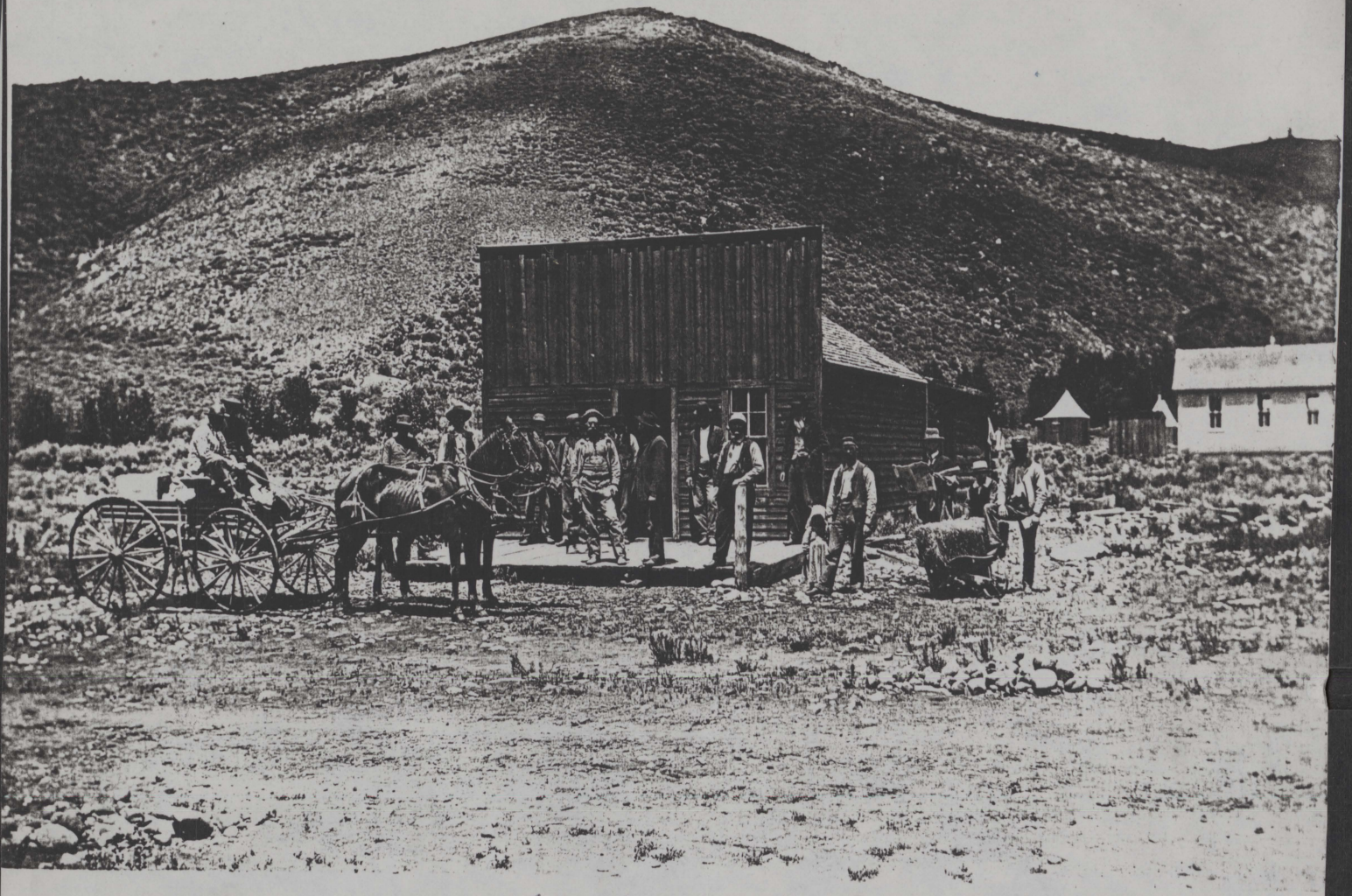
Miners at Ohio City -