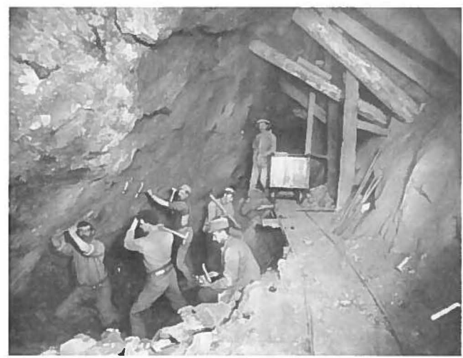
Figure 1: The Gold King Mine in 1899, Data from Colorado Public Radio, accessed June 15, 2016, http://www.cpr.org/news/story/gold-king-mine-1887-claim-private-profits-and-social-costs

an additional twenty stamps were purchased in order to increase production and profits further ^{22}