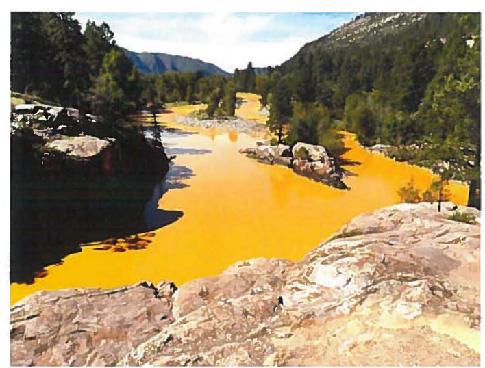
Figure 3: The Animas River During the Plume at Bakers Bridge in Durango, Data from KNAU Arizona Public Radio, accessed June 15, 2016, http://knau.org/post/epa-says-gold-king-mine-spill-dumped-880000-pounds-metals-river

Although originally estimated to be roughly 1 million gallons, later calculations found the plume consisted of 3,043,067 million gallons of acid drainage. This volume is the equivalent of "9 football fields spread out at one foot deep". <sup>28</sup> Fortunately, the health effects of this spill were made less severe through dilution.