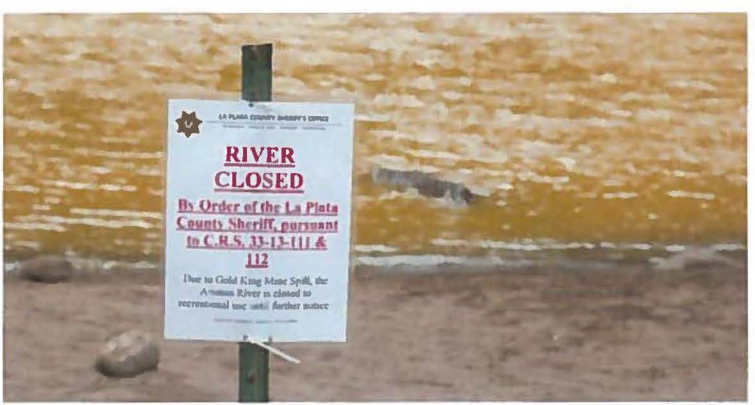
Figure 5: River Closed Sign Posted on the Animas River During the Plume, Data from The Daily Signal , accessed June 16, 2016, http://dailysignal.com/2015/08/13/after-epaspills-toxic-waste-in-colorado-river-nearby-residents-hope-for-recovery/

$5 million. The majority of this sum is requested by to industries: rafting and agriculture.<sup>21</sup>