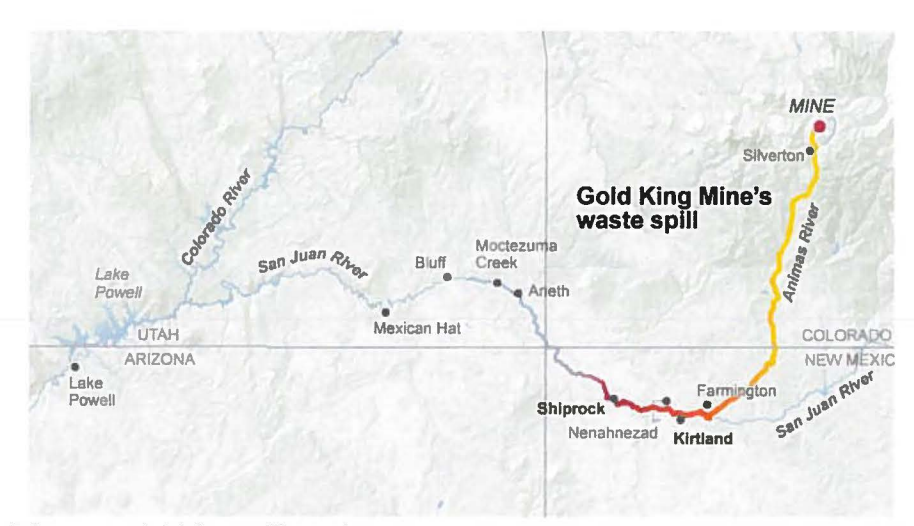
Figure 2: Rivers and Cities Affected by the Gold King Mine Spill, Data from The LA Times , accessed June 15, 2016, http://www.latimes.com/visuals/graphics/la-na-g-gold-king-mine-river-spill-20150814-htmlstory.html

The Gold King Mine blowout initially released three million gallons of acid drainage into the Upper Animas Basin, which is part of the larger Colorado River Basin. Yellow sediments flowed down Cement Creek, into the Animas River, then the San Juan River, and eventually made their way it to the Colorado River. Due to its reach, the Gold King Mine spill contaminated the water for Colorado, New Mexico, Utah, Arizona, and the tribal lands of the Southern Ute, Navajo, Ute Mountain Ute, and the Jicarilla Apache.<sup>24</sup>