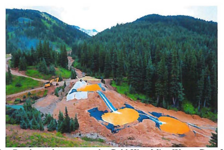
Figure 6: Settling Ponds used to process the Gold King Mine Waste, Data from The Albuquerque Journal , accessed June 15, 2016, <a href="http://www.abqjournal.com/628976/gold-king-mine-spill-a-disaster-waiting-to-happen.html">http://www.abqjournal.com/628976/gold-king-mine-spill-a-disaster-waiting-to-happen.html</a>

The treatment process begins by rerouting the acid drainage through a "4,800-foot pipe that runs from the portal of the Gold King Mine down a steep slope into the treatment system at Gladstone." It is in Gladstone that the contaminated water enters the settling ponds. At this stage, lime is injected into the acid drainage in order to raise the PH level from an acidic 3 to a neutral 7. Then, the water is "mixed with chemicals that cause clean water to rise and the metal-laden sludge to settle at the bottom of a tank." With the contaminants separated, the top layer of clean water flows into Cement Creek while the "metal sludge is directed into filter bags adjacent to the treatment plant." These filter bags have to be replaced every 18 months.